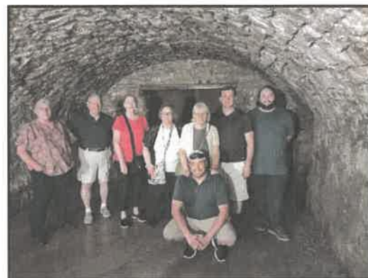
Photo of those who went down to tour the artesian well.